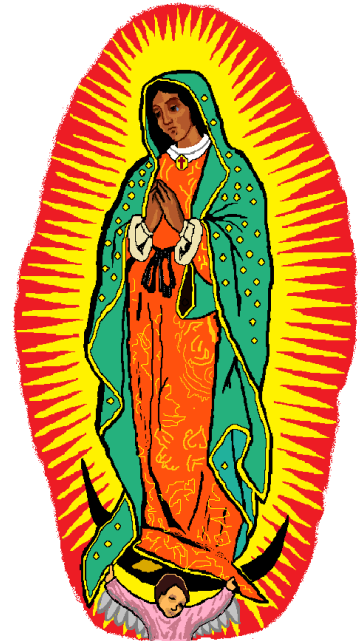
The Virgin of Guadalupe

The fiesta of the Virgin of Guadalupe is not an official celebration of the country of Mexico. It is a religious celebration of the Catholic Church and of the people.